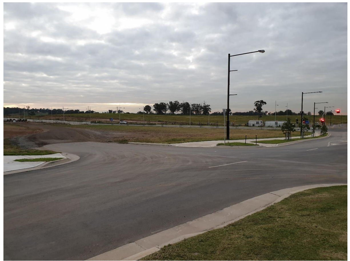
Figure 9: Looking NW towards proposed temporary overflow car park site. Proposed Tavern site and DJD - CA intersection in the distance on the right.