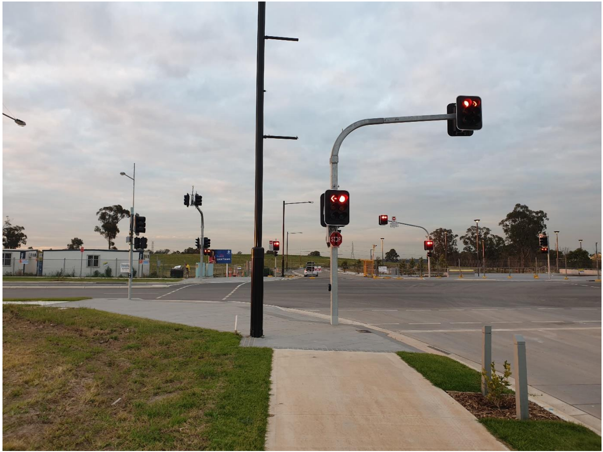
Figure 1: Looking north towards the Dick Johnson Drive - Central Avenue intersection. Proposed Tavern site on the left and approved riparian corridor and splash park to right.