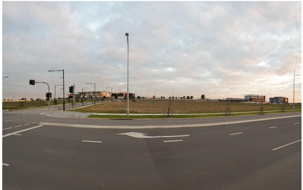
Figure 7: Looking south towards proposed temporary overflow car park site from the SE corner of the tavern site. Camden Council and Oran Park Library (250 metres) visible on the left and Oran Park Podium (350 metres) to the right.