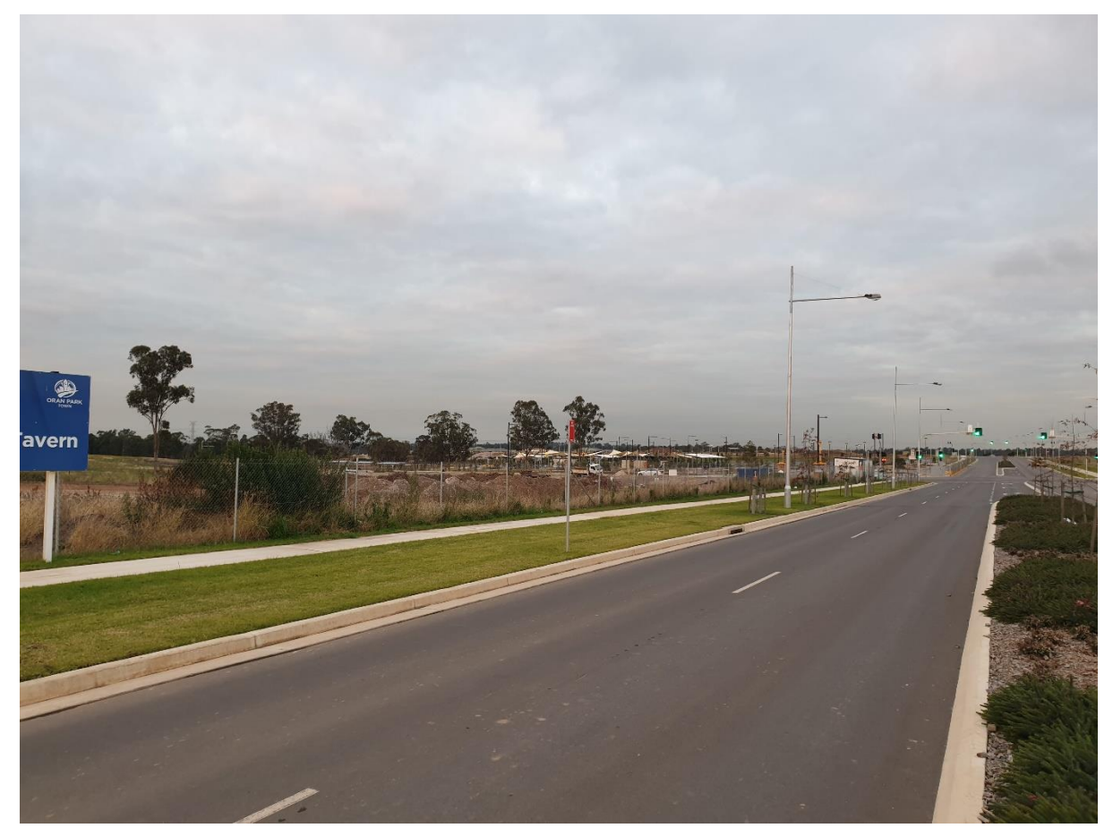
Figure 4: Looking NE from DJD - West Perimeter Road intersection towards proposed Tavern site. DJD-CA intersection can be seen in the distance on the right.