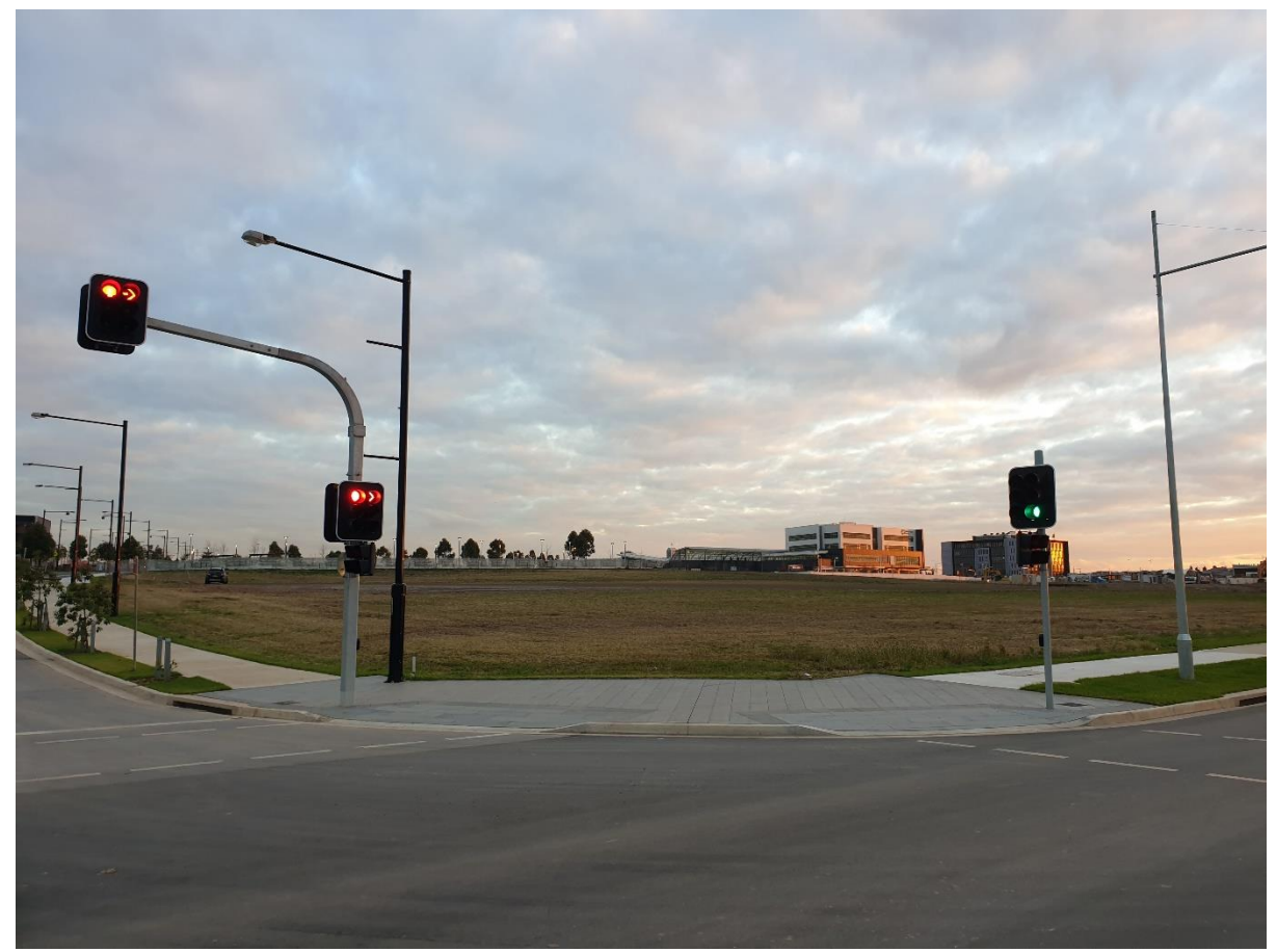
Figure 8: Looking SW towards proposed temporary overflow car park site from the DJD - CA intersection. Oran Park Podium visible in distance (350 metres).