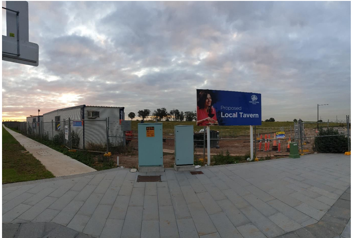
Figure 3: Looking NW from DJD-CA intersection towards proposed Tavern site.