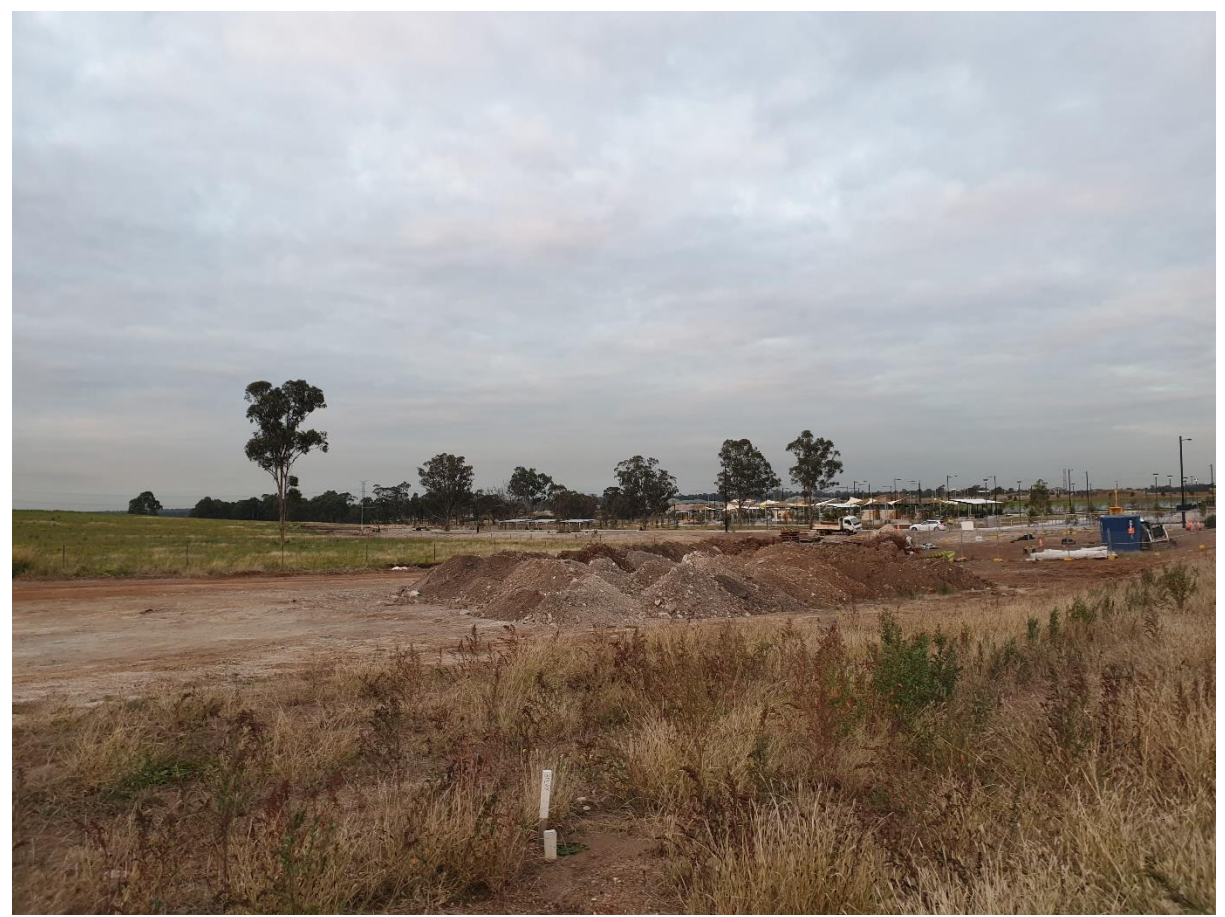
Figure 5: Looking NE from SW corner of Tavern site. Approved splash park buildings visible in the distance.